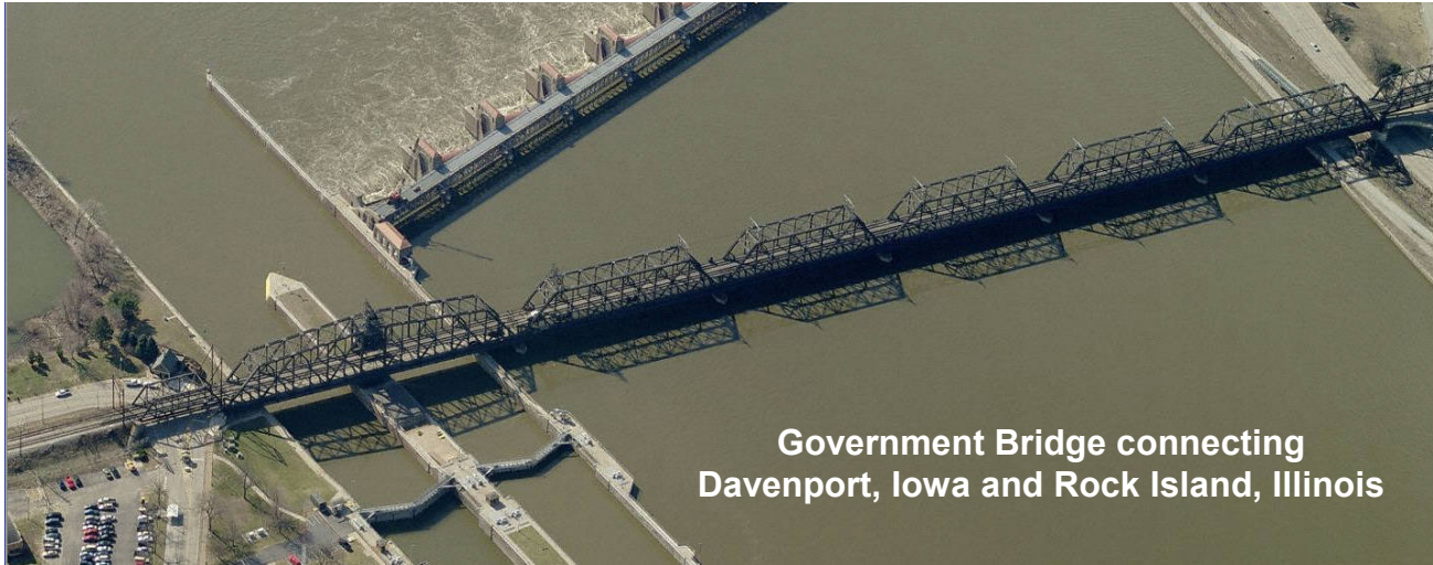
Government Bridge connecting Davenport, Iowa and Rock Island, Illinois